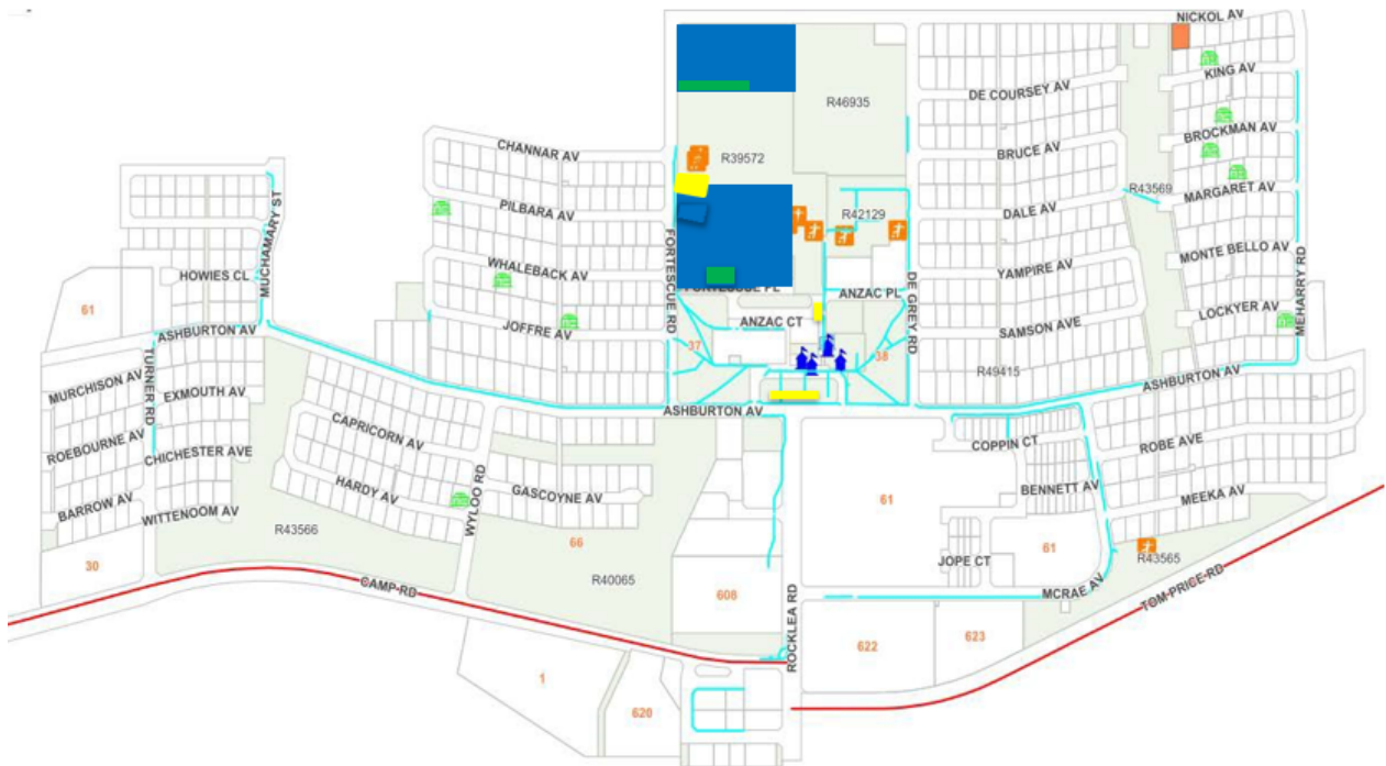
Open Trading Zone - Peter Sutherland Oval