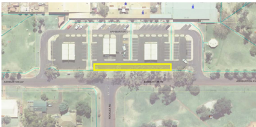
Open Trading Zone - Shopping Precinct