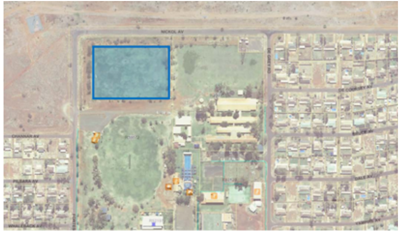
Events - Peter Sutherland Oval (bays to be marked and numbered)