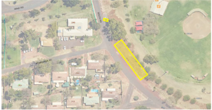
Open Trading Zone - Softball Oval