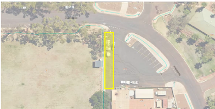
Open Trading Zone - Village Green Carpark