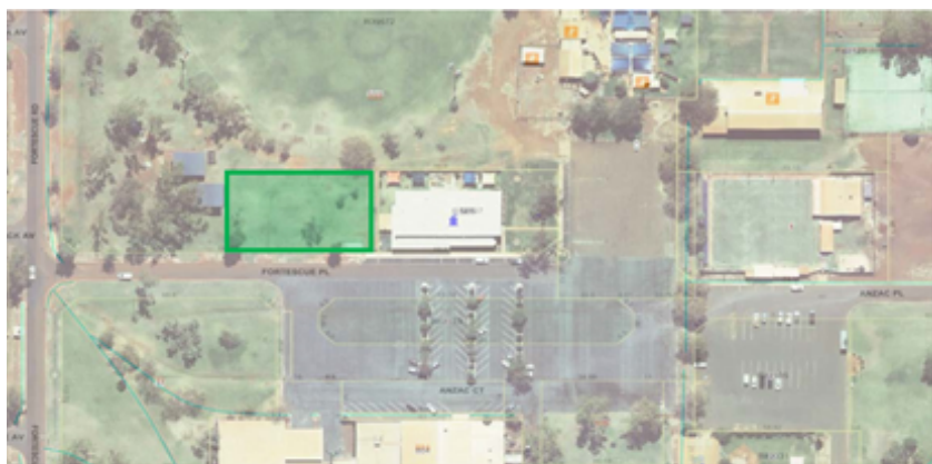
Invited Trading Zone - Peter Sutherland Oval