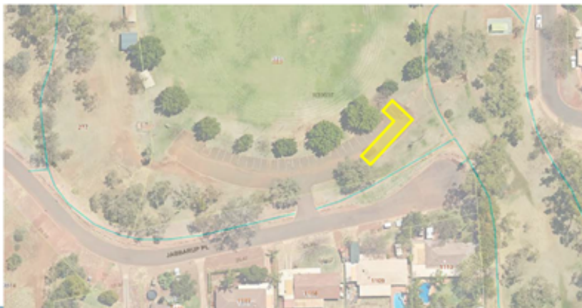
Open Trading Zone - Area W Oval