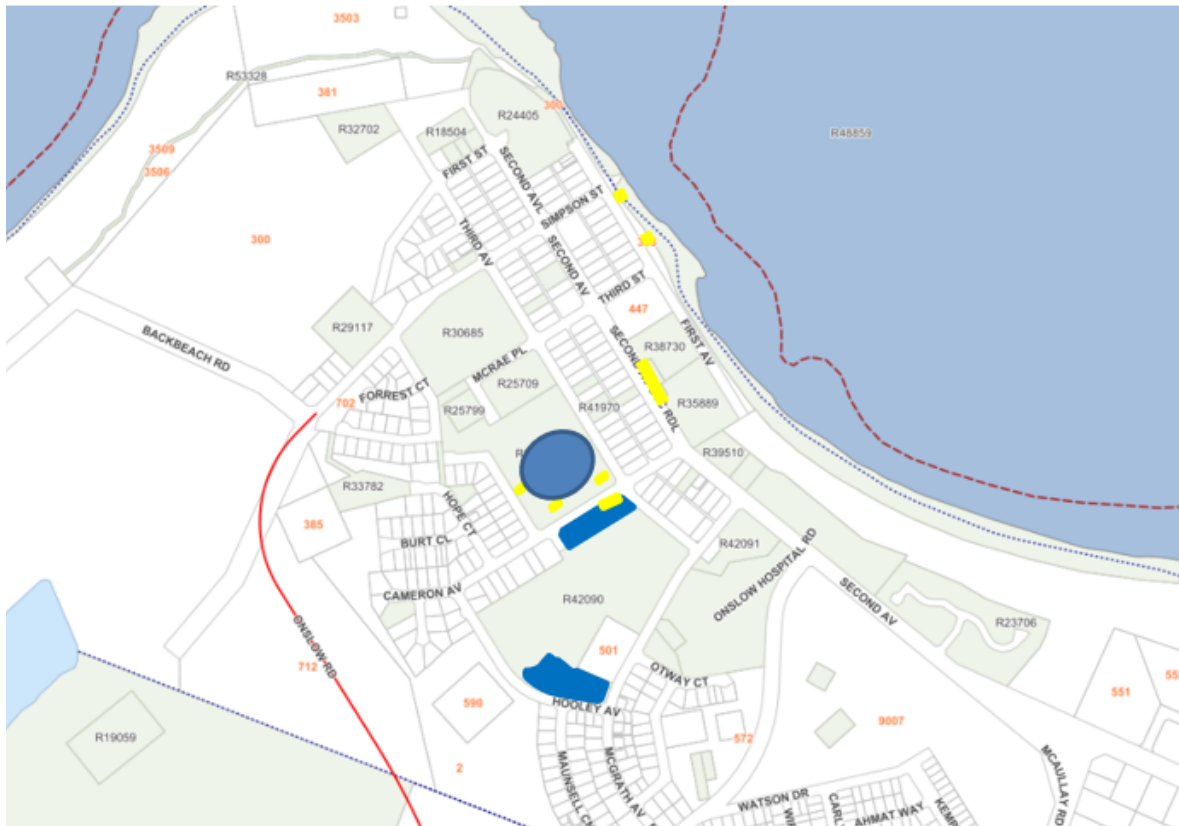
Open Trading Zone - Onslow Foreshore