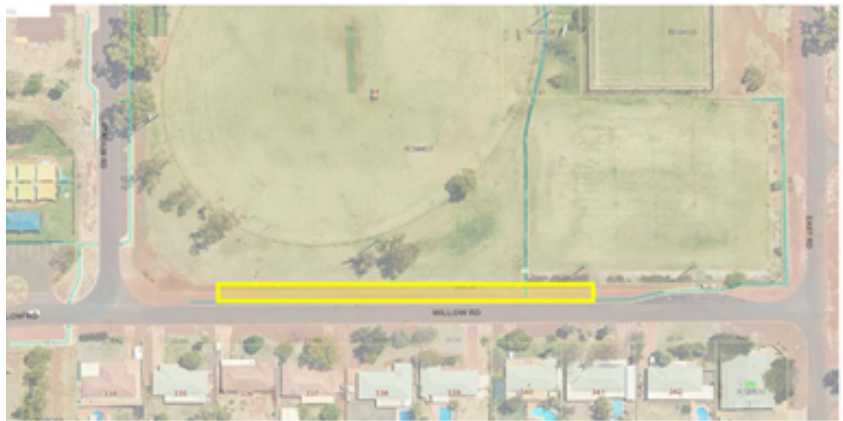
Open Trading Zone - Clem Thompson Oval