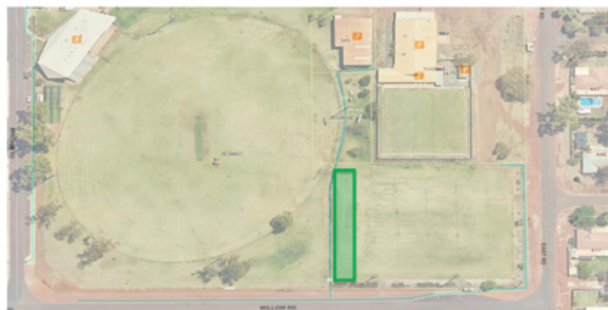
Invited Trading Zone - Soccer Field (Clem Thompson Oval)