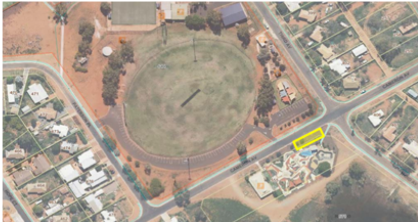
Open Trading Zone - Skate Park