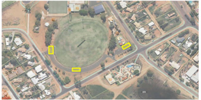
Open Trading Zone - Thalanyji Oval