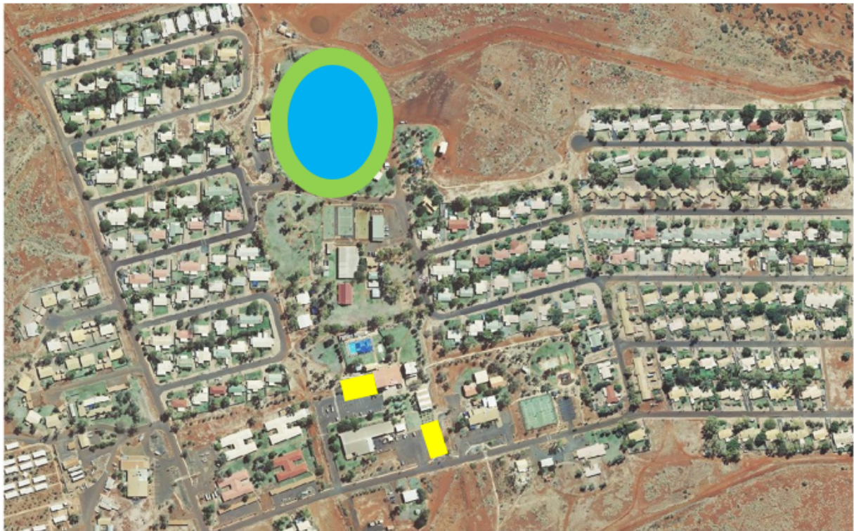
Open Trading Zone - Pannawonica Shopping Precinct