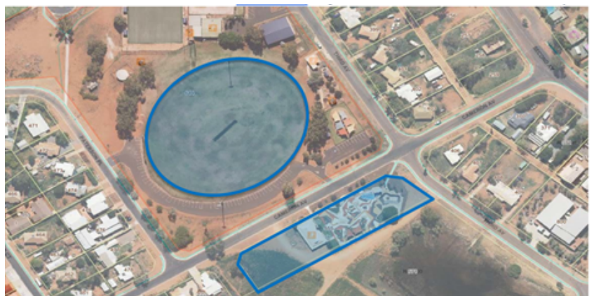
Events - Thalanyji Oval (bays to be marked and numbered)