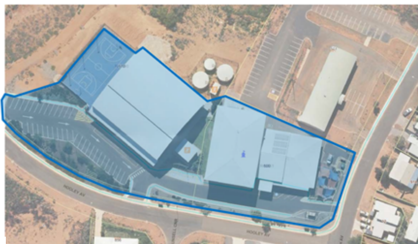
Events - Multipurpose Centre (bays to be marked and numbered)