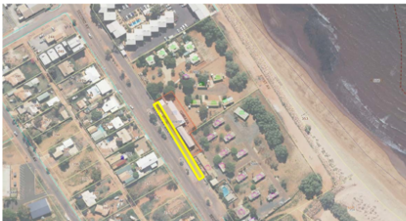
Open Trading Zone - Visitors Centre