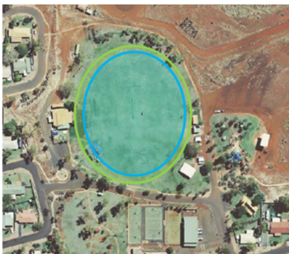
Invited Trading and Events Zone - Pannawonica Oval (bays to be marked and numbered)