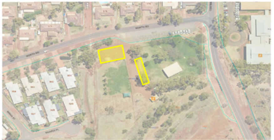
Open Trading Zone - Dog Park