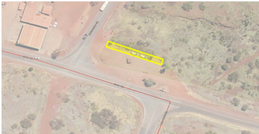
Open Trading Zone - Tourist Information Bay