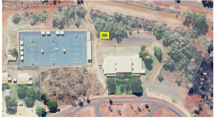
Open Trading Zone - Area W Courts