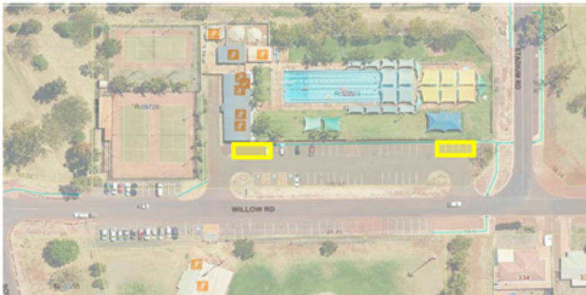
Open Trading Zone - Vic Hayton Memorial Swimming Pool