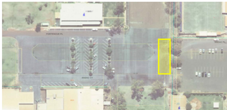
Open Trading Zone - Shopping Precinct (rear carpark)