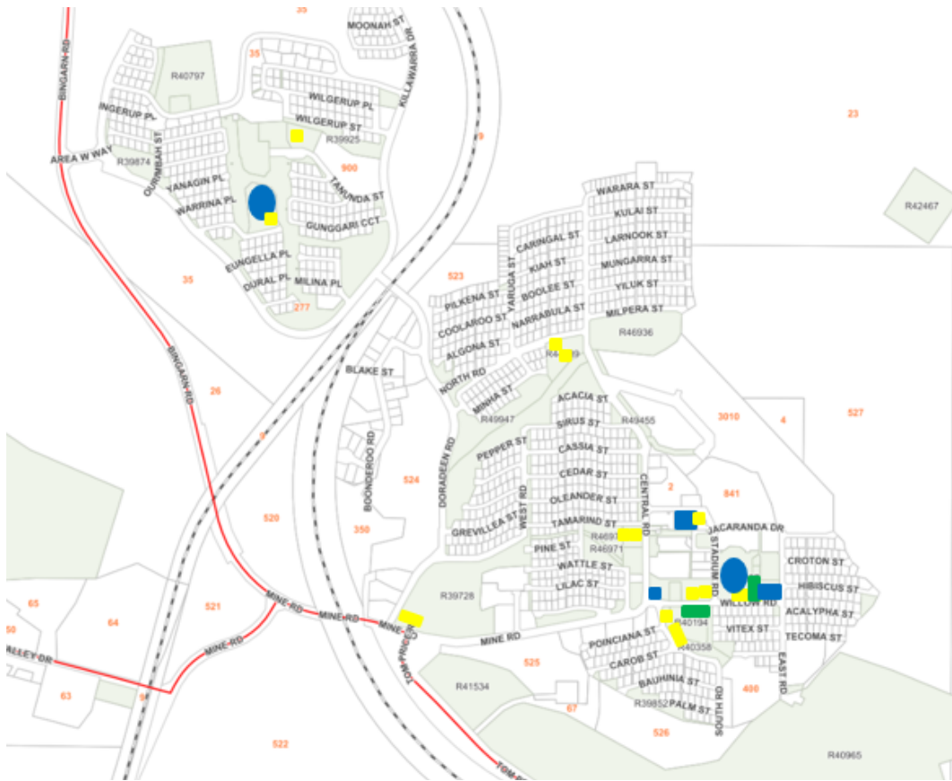
Open Trading Zone - Community Centre Carpark