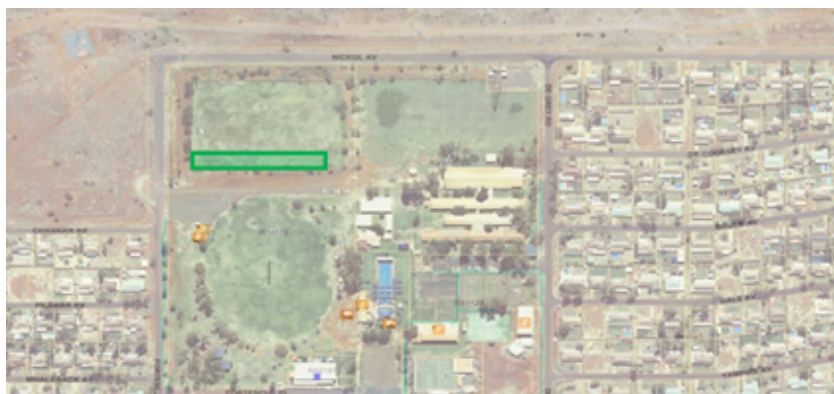
Invited Trading Zone - Peter Sutherland Oval